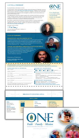
In-pew brochure/ envelopes